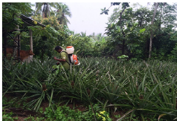
Fig. 2 Spraying of novaluron IGR to a selected test pineapple plantation

avoid flushing off the chemical or evaporation by UV in the dry season.