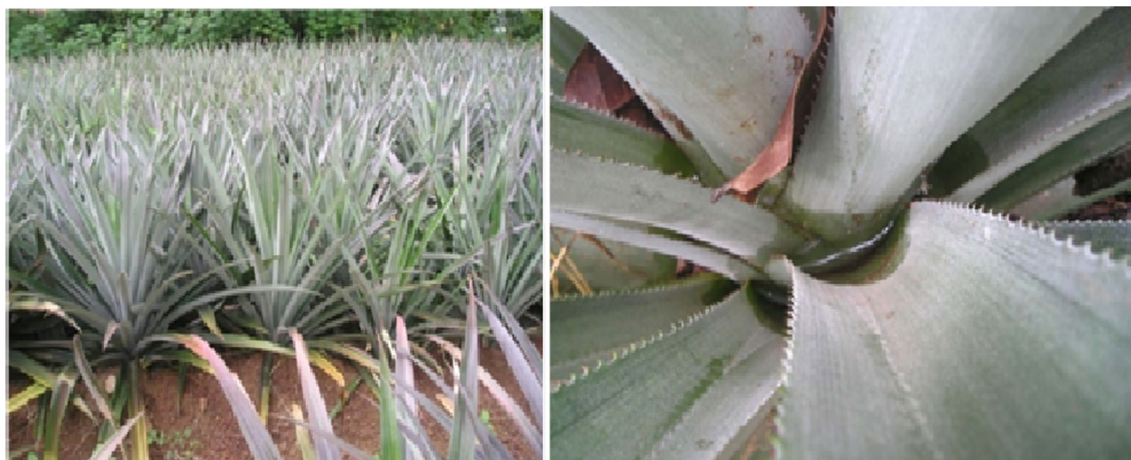
Fig. 1 Selected pineapple plantations indicating the accumulation of water in leaf axils

The immature stages in leaf axils were collected at weekly intervals from January to March 2019 up to 12 weeks after introducing the chemical. The intervention trials with IGR were conducted from January to March 2019. This period corresponds to the latter part of the North-East monsoon and first inter-monsoon in Sri Lanka, with moderate and limited rainfall intensities, respectively. This specific period was selected for the intervention to