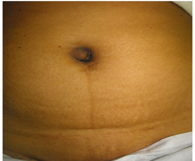
Figure 1. Umbilical lump with bluish discolouration.

Fine needle aspiration cytology of the umbilical nodule confirmed the diagnosis as endometriosis at the umbilicus. Following a discussion with the patient and clear explanation about the possibility of recurrence and the need to remove the umbilicus, the nodule was completely excised with the umbilicus and the defect was repaired. As the patient was not concerned about the cosmetic outcome, umbilical reconstruction was not