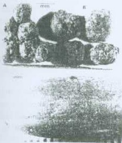
Fig: 04: Wild Plants' remains found from Bell Lena in Sri Lanka

Even in this study ideas on the prehistoric studies in Sri Lanka is very small. But different scholars have studied plant fossils at different times and presented different ideas (Deraniyagala 1943).