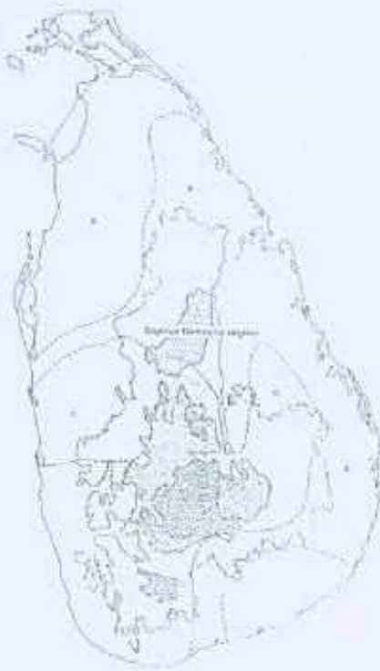
Fig: 02. Prehistoric site map in Sri Lanka, Dry zone & wet Zone

were permanent settlements (Isaac 1978, Perper et al 1979) (fig 02).