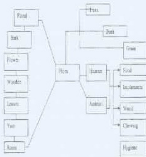
Fig: 06. Floral utilization pattern of Sigiriya-Dambulla region

Considering the manner in which environmental conditions have affected man in Sri Lanka some scholars have attempted to divide the island into several climatic zones (Deraniyagala 1992, Wadia 1941, Domros 1974). But when taken as a whole it is reasonable to divide the country into wet and dry zones. But some plants can be seen in both zones (fig. 06).