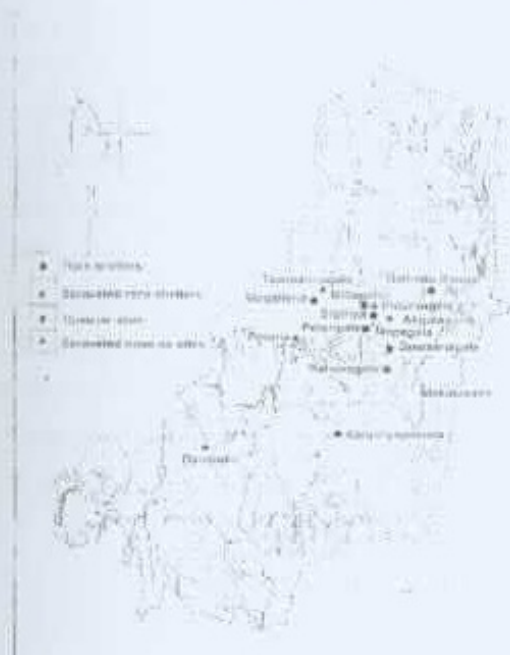
Fig 01. Prehistoric site map in Sigiriya- Dambulla region

Any group of people or tribe living in any country or region follow an economic pattern or a mixture of patterns specific to them. This could be one deliberately built by the people or that evolved naturally. In an economic pattern built up in this manner features developed in different ways can be identified. This can develop in a continent or a sub continent or an