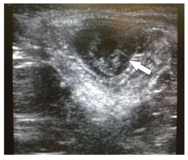
Figure 2. Ultrasonographic view of the puborectalis muscle (arrow)

identified (Figure 2). The anal sphincter complex appears on ultrasonography as a hypoechoic ring shadow. The puborectalis appears as a 'V' shaped mixed echogenic shadow encircling the spinchters. With sonographic guidance a 26g needle was introduced in to the puborectalis sling and 50 units of botulinum toxin was injected in to each limb of the puborectalis sling under sonographic guidance. Although the needle cannot be visualized sonographically the movement of muscle fibres with the penetration of the needle is used as a guide. Post operatively the patient was managed with oral analgesia and syrup lactulose 30 ml nocte. She was advised to have a fibre rich diet and adequate amount of water. Using of a squatting pan for the act of defecation was recommended as the pelvic floor muscles are maximally relaxed in this position. Patient was discharged on post procedure day one and reviewed at post procedure two weeks. Patient had dramatic improvement of symptoms with biofeedback, two weeks after the procedure. On further follow up her symptoms reappeared at 1 month following the procedure. Injection of botulinum toxin was done for the second time in the same manner.