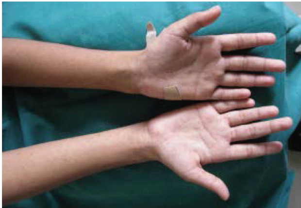
Fig 1. Discrete erythematous maculo-papular rash of spotted fever group rickettsioses