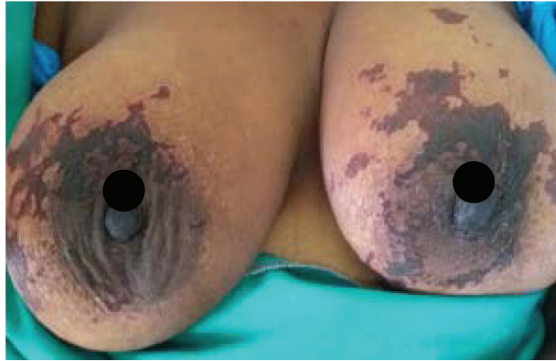
Fig 4. Purpura fulminans. 9

Asian regions may result in purpura fulminans, characterised by rapidly progressive purpuric lesions developing into extensive areas of skin necrosis (Fig 4), and peripheral gangrene with laboratory evidence of consumptive coagulopathy; it is often fatal. 9,10