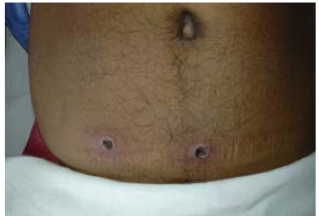
Fig 2. Eschars: the characteristic entry wound of scrub typhus and some spotted fever group rickettsioses.

depends on the region. 4 Therefore, it is important to recognise both the typical and atypical manifestations of rickettsial infection in each region to promptly diagnose and treat these infections, as they can be associated with significant morbidity and mortality. Rickettsial infections are a major cause of non-malarial febrile illnesses among returned travellers to endemic areas. 3,5