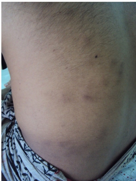
Figure 1 Panniculitic type skin rash with tender hard nodules.