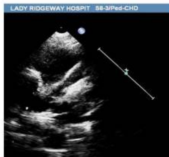
Figure 1: Dilated coronary arteries and coronary artery aneurysm at LMCA & LADA on day 35

He was started on IV methylprednisolone 30mg/kg, continued for three days, followed by oral prednisolone for 2 weeks.