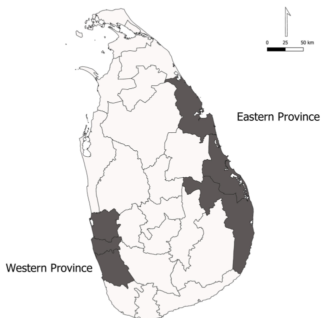
Figure 1 Map of Sri Lanka.