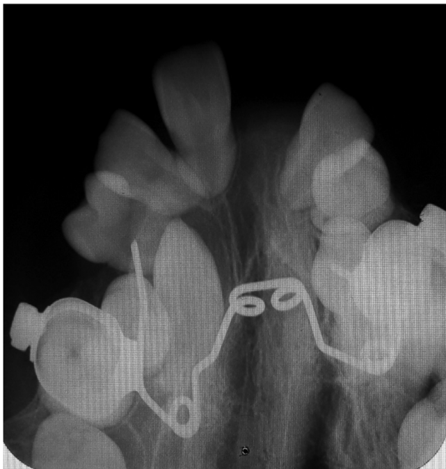
FIGURE 2 Occlusal x-ray of the upper jaw of Patient 7

The orthopantomograph at the age of 19 years (Figure 1g) showed a fixed orthodontic appliance in the upper jaw. The left upper canine was aligned into the dental arch by orthodontic therapy. The additional occlusal x-ray of the maxilla (Figure 2), which was performed about a year before the orthopantomograph, showed palatal impaction of the upper right canine and severe crowding in the lateral segments, and this impacted canine was surgically removed in the time frame between the two x-rays. The upper third molars were missing, and the lower third molars were microdonts. In total, the patient showed 25 permanent teeth at that time. All incisors demonstrated extremely shortened roots. The roots of the upper canines and premolars were also moderately shortened. The canines and