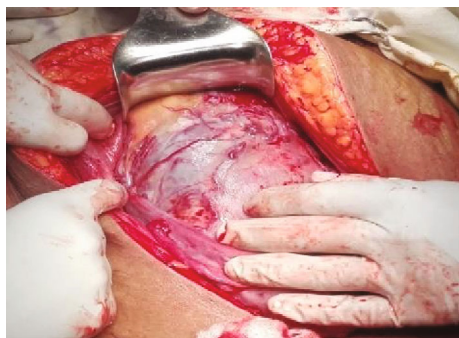
FIGURE 1: Intraoperative appearance of the uterus and bladder morphologically resembling placenta percreta.

praevia. Two-dimensional (2D) greyscale ultrasonography showed features of morbid adherence (loss of the “clear zone,” presence of abnormal placental lacunae, bladder wall interruption, and myometrial thinning). 2D colour Doppler revealed uterovesical hypervascularity, subplacental hypervascularity, and bridging vessels with possible bladder wall involvement. Her antenatal period was otherwise unremarkable. She underwent a classical CD (without disturbing the placenta) through a midline incision and sterilization at 37 weeks of gestation. The intraoperative appearance of the uterus and bladder morphologically resembled placenta percreta (Figure 1). After delivery of the baby, the cord was ligated at the placental insertion and the uterus was closed keeping the placenta in situ, without any attempt of removing. The intraoperative blood loss was 250 mL. Her recovery was unremarkable. At each follow-up visit, symphysial-fundal height, serum beta-HCG, and ultrasonographic volume of placental mass were measured (Table 1). During the follow-up period, the woman had few episodes of mild vaginal bleeding, which did not need any intervention. Follow-up was done weekly in the first month and then monthly visits until complete resorption of the placenta. She resumed menstruation six months after the delivery.