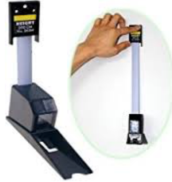
Figure 2. Drop-down scale

the OP clinic using both the stadiometer with carpenter's level and the drop-down scale with carpenter's level keeping with the technique mentioned below. In addition, we drew two parallel lines on either side of the drop-down scale to make the patient stand straight as possible. Height was measured three times and the average was taken. We also measured height three times in 172 OP patients only by using the drop-down scale with the carpenter's level to see whether one height measurement is as good as the average of three measurements.