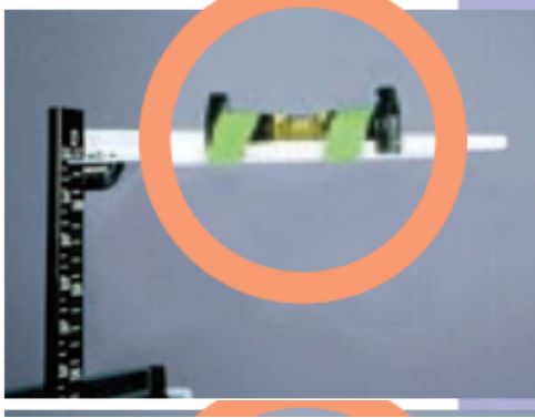
Figure 1. Stadiometer with the carpenter's level