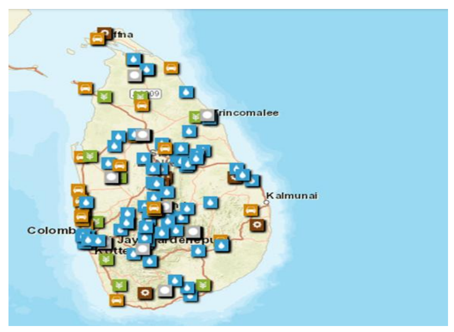
Figure 03: The World Bank's support projects in Sri Lanka

The Country Partnership Framework (CPF), a strategic plan that defines the World Bank Group's engagement with its partner countries, outlines objectives to support the government in achieving its articulated vision and incorporates feedback from stakeholders from around the country, including government, the private sector, academics and civil society organizations. World Bank wants the Country Partnership Framework to resonate with the public and with the people who will be the beneficiaries of the World Bank Group's support. So they essentially test ideas by going throughout the country and speaking to persons from all walks of life and all ages, the private sector, central and local governments, university students, faith-based and civil society organizations; in secondary cities and in the capital. The World Bank's Lanka includes 13 support in Sri active projects totalling $1.70b operating in 163 locations.