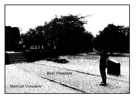
Figure 12. Viewing Guide

In the Augmented Reality interface, the model was slightly glitched due to the environment disruptions such as people walking, dust and overexposure because of sunlight. Due to these reasons, the application could not place the 3D model over the tracker at some points. But this was