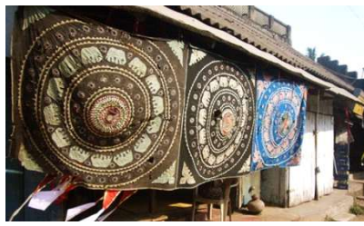
fig 16 Contemporary Version