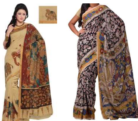
fig.9 Traditional Kalamkari saree