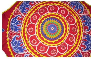
fig17 Traditional chatti (umbrella)