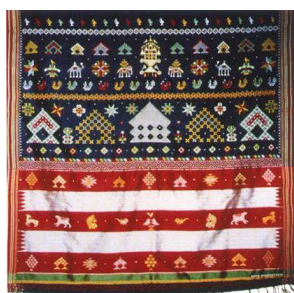
fig.5 Chandrakali saree with kasuti pallu