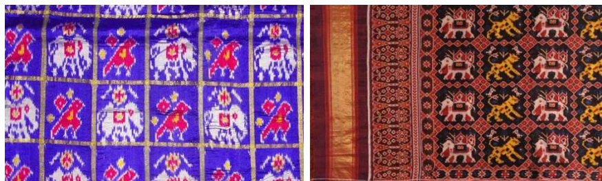
fig.3 A modern-day single ikat Rajkot Patola featuring elephants and parrots in radiant contemporary colours fig. 4 A rare double ikat Patan Patola design featuring fighting elephants and tigers from Patan, Gujarat

particularly auspicious. The Pan Bhaat (Leaf Design) is one of the most frequent patterns. It is a motif indigenous to India and can be traced back as far as the pottery of the Indus Valley culture. Today, with only four families making Patola sarees, Patola weaving is languishing 5 . Patola is mostly used as wedding saree in Kathiawar and Gujarat.