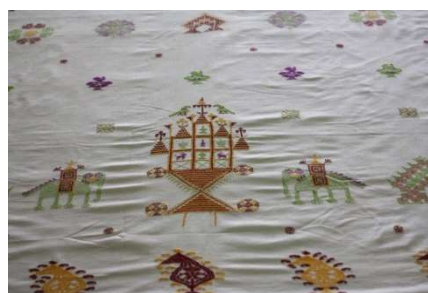
fig. 6 Kasuti pallu with depicted scenes

Lastly lets discuss about the variations and similarities in paintings of these regions. For study the research covers the paintings Manjusha, Mithila and Madhubani painting of Bihar, Pattachitra