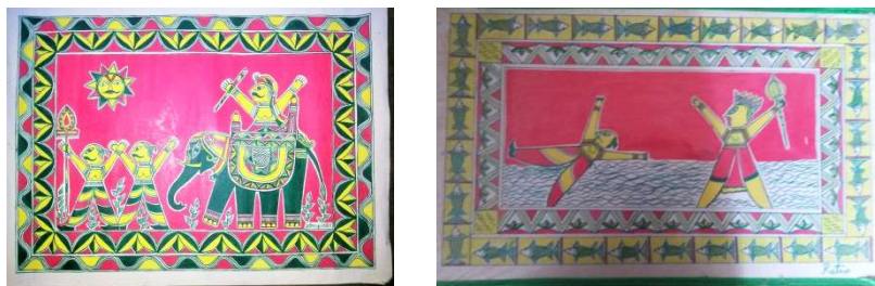
fig.7 & 8 Manjusha Art has restriction to use three colours: Pink, Green and Yellow

The history of this painting traces back to the 6th century where the worship of the snake deity Naga was not revered. The painting mostly is of religious importance. It focuses mostly on the significance of worship of the Nag deities. It depicts the history and significance of the snake deities and rituals and customs pertaining to them. Today they make different type of products likes, jute bag, pen stand, silk saree, light stand, wall hanging, flower stand season's card greeting card jute executive folder etc.