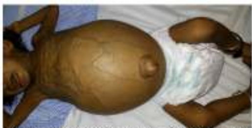
Figure 2: Image showing a one year old with successful KPE developing PHT, gross ascites and malnutrition *Permission given by parents to publish photograph

Ascites: Low albumin in CLD results in accumulation of fluid in the extravascular space leading to oedema, ascites and pleural effusion. PHT also contributes towards formation of ascites. Presence of ascites is one of the variables that increase the mortality in children with CLD 11 . Onset of ascites indicates decompensation of liver disease and the need for LT. Ascites increases the risk of bacterial peritonitis and hepatorenal syndrome, which potentially adds to the already increased mortality associated with liver decompensation. Apart from the above-mentioned two complications, ascites decreases the mobility of the patient and causes respiratory distress, potentially affecting the quality of life (Figure 2).