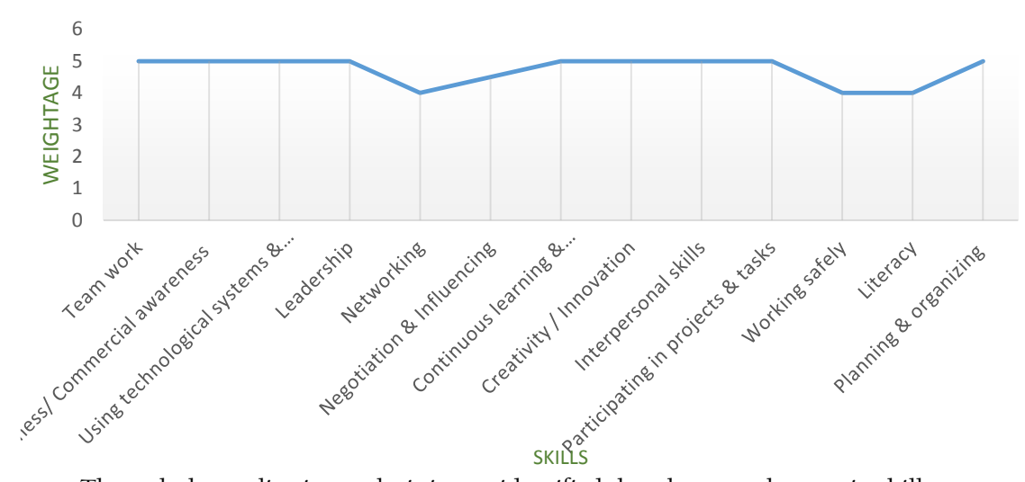
Figure 2: Weightage responses for the selected skills

Through the qualitative analysis it was identified that there are three main skills which all the companies are highly considering when they are recruiting a new graduate. They are team work, interpersonal skills and planning & organizing.