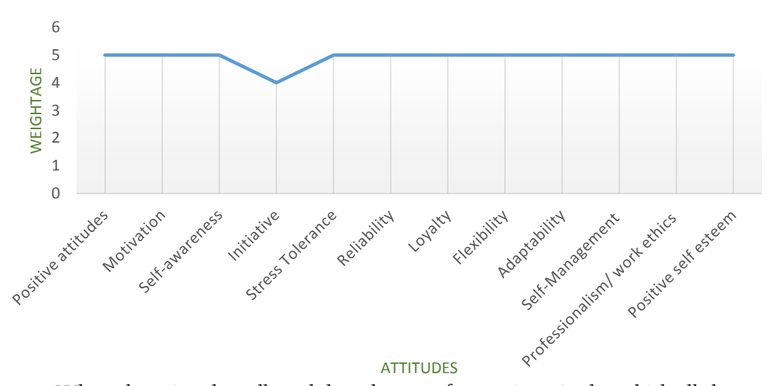
Figure 3: Weightage responses for the selected attitudes

When observing the collected data there are four main attitudes which all the companies are highly considering when they recruiting a fresh graduate. Those were positive, loyalty, flexibility, professionalism/ work ethics. So according to the findings of the research it can be conclude (Figure: 3) that all the companies are strongly agreed in most of the attitudes and these attitudes have the first priority of those companies when recruiting a fresh graduate.