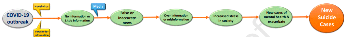
Figure 1: flowchart of the Suicide in the context of Infodemic during COVID-19 pandemic

messaging services such as WhatsApp and Telegram, and these services offer private, intimate, and often encrypted communications. Therefore, it is almost impossible to moderate misinformation on them. Thus, these services require adopting relationship-centred and culturally informed approaches in public health promotion to mitigate the spread of false data (18) (Figure 1).