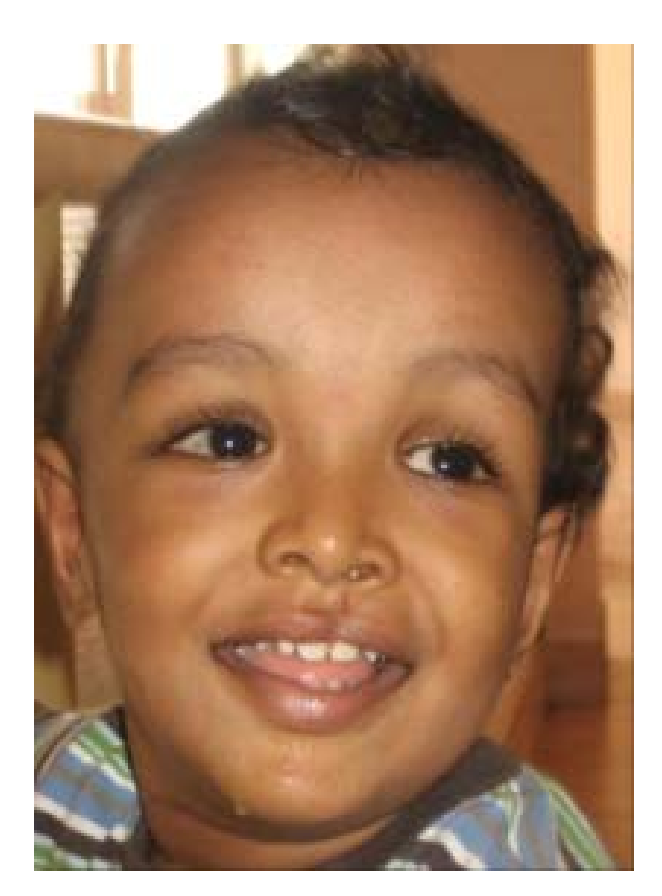
Figure 1. Patient at the age of 15 months. Note incomplete cleft lip, frontal bossing, bitemporal balding with high frontal hairline and down slanting eyes.

This boy fulfilled two of the criteria but a definite diagnosis was not possible due to his growth parameters being atypical.