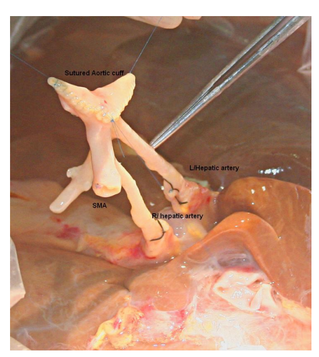
Figure 2. The reconstructed aortic patch.

A replaced right hepatic artery arising from the SMA occurs with a frequency of 12-20% [1]. These vessels usually pass lateral and behind the portal vein and enter the hepatoduodenal ligament posterolateral to the bile duct. When confronted with a variation such as this, the alternative is to anastomose the left and right hepatic arteries separately. But the technique we adopted was simple, technically easier and probably has a higher chance of vessel patency.