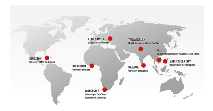
Figure 2 Evidence for Better Lives Study sites.

Participating sites were selected according to the following criteria: (1) country status of a low-middle and upper-middle income economy, <sup>36</sup> (2) representation of different regions of the world, (3) a political environment receptive to research-based evidence, (4) the presence of local research teams with the expertise and willingness to conduct comparative research and engage in advocacy based on the findings and (5) existing links of the research teams with local prenatal healthcare services to facilitate access to the target sample. In 2017, the participating sites and associated research teams were decided as follows (figure 2): Valenzuela (University