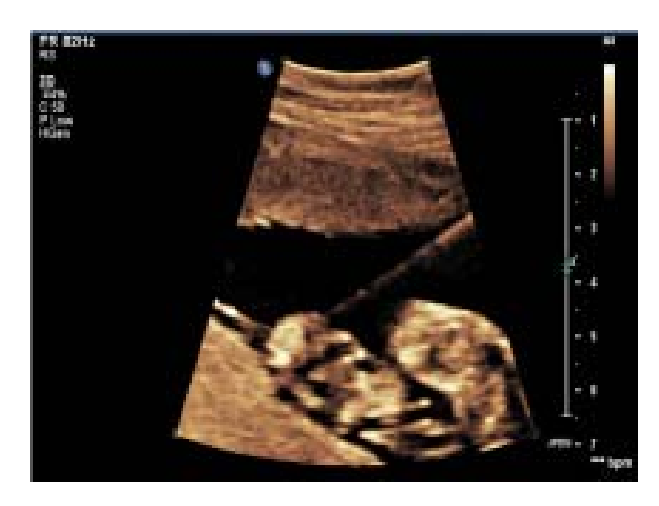
Figure 3. Cordocentesis and fetal blood transfusion into the placental cord insertion.

was not routinely performed in Sri Lanka and it has been recently started<sup>9</sup>. The first intrauterine fetal blood transfusion was performed in 1963 by Liley, utilizing an intraperitoneal approach<sup>10</sup>.With time the procedure has been modified to involve an intravascular approach the safety of which has increased with improvements in ultrasound technology<sup>11</sup>. Recognized intravascular techniques utilize for intrauterine blood transfusions include cordocentesis (usually into the umbilical vein either at the point where the cord inserts into the placenta or into the baby's liver, or into a free loop of cord) or into a blood vessel in the baby's liver (intrahepatic transfusion) (Figure 3).