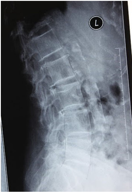
Figure 2 Lateral view X-ray of a lumbar sacral spine to detect spondylolisthesis. Two vertical lines are drawn along the anterior and posterior borders of the vertebral bodies to detect a spondylolisthesis. There is no spondylolisthesis visible in this X-ray.

To see whether the results were reproducible, repeat measurements were carried out on 10 radiographs. This showed that the individual measurements would be within \pm 0.16 cm of the actual value at 95% significance. 26