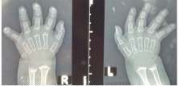
Figure 5: X-rays of both wrist joints showing metaphyseal changes in distalradius and delayed assification of carpal bones

Spondylo-metaphyseal dysplasia was diagnosed based on the disproportionate short stature, small thoracic cavity, pectus carinatum and radiological features of generalized platyspondyly and metaphyseal changes. Molecular genetic testing was not performed due to financial constraints. Parents were counselled and regular paediatric clinic followup was arranged for height monitoring.