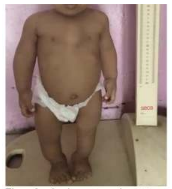
Figure 2: showing extreme short stature, bowlegs and pectus carinatum

She did not have kyphoscoliosis, organomegaly, corneal clouding or joint contractures. Her cardiovascular, abdominal and nervous systems were clinically normal. Haematological and biochemical investigations, including