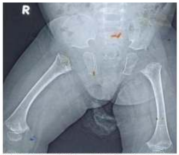
Figure 4: X-ray of pelvis and lower limbs showing short flared iliac wings, irregular hypoplastic acetabular roof and widening, sclerosis and irregularity of metaphysis