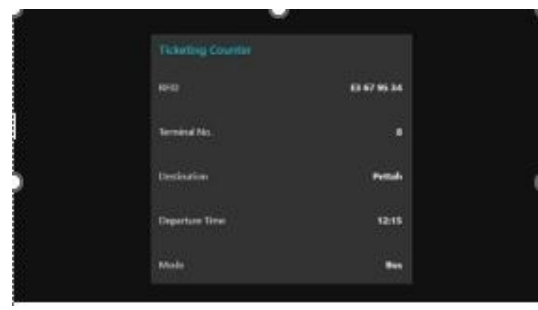
Fig.2. Travel Ticket

An RFID reader module is a device that scans and collects data from an RFID card. This card is useful for keeping track of stuff. RFID scans the details of users and uses it to gather information. Here RFID is used in two stages. In the first stage, the details of the vehicle and its owner are obtained and stored in the database and the RFID containing these details is given to the user. With this, the user can enter the parking lot. In the next step, the user will be able to get the fare for his trip from the database. After parking the vehicle, the user exits and executes his / her RFID to specify the destination. Based on the availability and user's preference user will be directed to a bus or the train. The user who returns to the parking lot after finishing his work will rescan his RFID again, open the gate, and take his vehicle out, his account will be calculated, and his amount will be sent to the user via the mobile app.