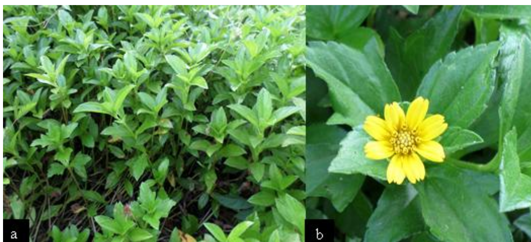
Figure 1 S. trilobata (a– Densely grown S. trilobata in a home garden in Sri Lanka, b- Flower of S. trilobata )

Aerial parts of S. trilobata were collected from the home gardens of the Gampaha district, Western Province, Sri Lanka, from November to December 2020. A voucher specimen of S. trilobata was deposited at the Department of Zoology and Environmental Management, University of Kelaniya, Sri Lanka. The flowers, dried yellow leaves, and dead stems were removed, and fresh S. trilobata parts were chosen, washed, and cut into 1cm pieces. Seventy-five grams of plant parts were mixed with 100 mL of distilled water and ground well. The resulting solution was filtered and centrifuged, and a stock solution of 7.5 \times 10^2 g/L