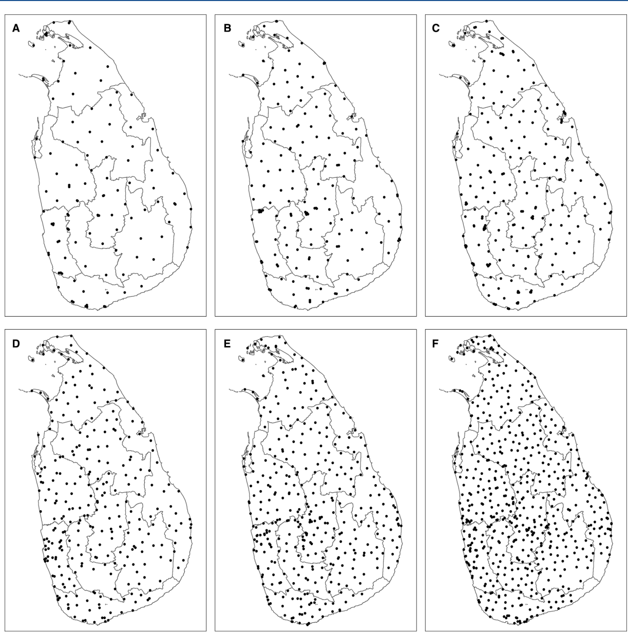
Figure 1 Grama Niladhari divisions selected by inhibitory geostatistical design with close pairs (ICP). Panel a) 10%, b) 15%, c) 20%, d) 25%, e) 33% and f) 50% of the original sample size in the National Snakebite Survey.

classical and ICP designs were substantially bigger than one, indicating the uniformly greater precision achieved by ICP designs relative to their classical design counterparts.