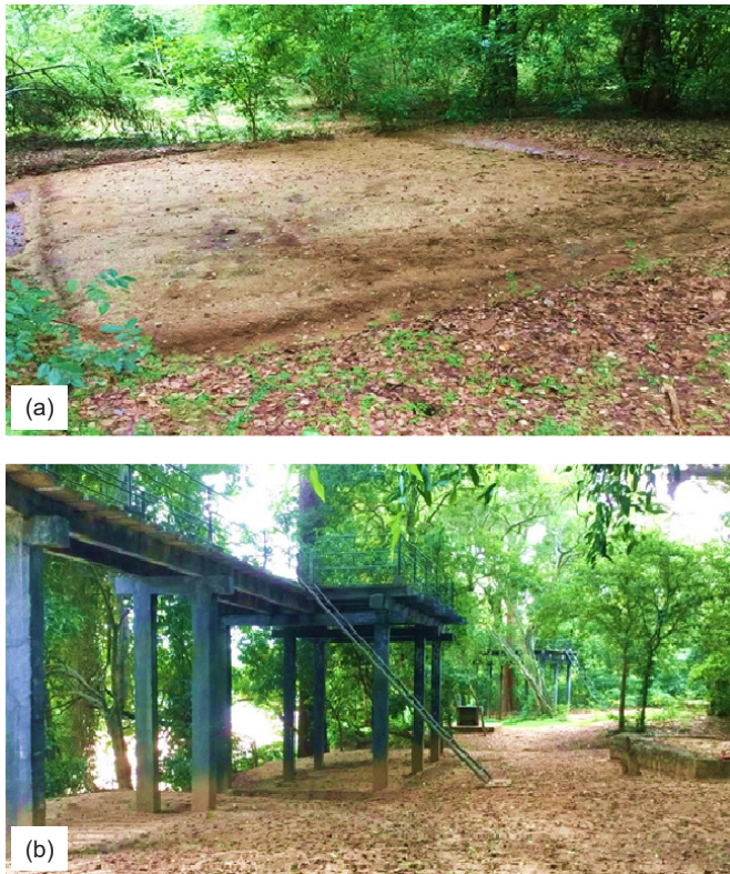
Figure 2: Undeveloped and developed campsites: (a) A typical undeveloped campsite with a designated elevated tenting area, Udawalawa NP; (b) A developed campsite with elevated camping platforms and other supporting structural facilities, Wasgamuwa NP.