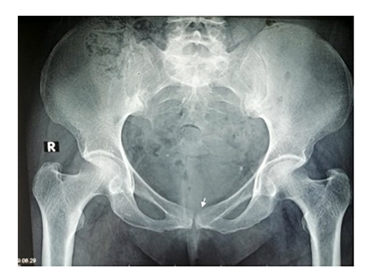
Fig. 1. X-ray of the pelvis showing blurring of bone margin more prominent on the left side suggestive of bone edema and inflammation of the pubis symphysis (white arrow).

antibiotics. Initially she was treated with intravenous co-amoxiclav 1.2\,\mathrm{g} eight hourly for 8 days. However, despite symptomatic relief following analgesics and antibiotics, her C-reactive protein level was rising. An X-ray radiograph of pelvis showed blurring of the bone margin suggestive of bone inflammation (Fig. 1).