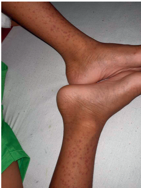
FIGURE 2: A photograph demonstrating classical nonblanching and a palpable purpuric rash over extensor surface of legs.

for the age and sex. The abdomen was soft and nontender without palpable masses or organomegaly. Nervous system examination revealed a conscious and well-oriented child with a Glasgow Coma Scale of 15/15. He had normal muscle tone and power in all four limbs with exaggerated deep tendon reflexes and extensor plantar response in bilateral lower limbs. His pupils, fundi, and cranial nerves were normal, and he did not have neck stiffness or Kernig's sign.