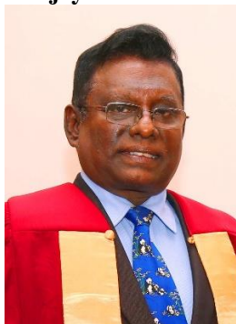
At the age of 65 years; time of retirement