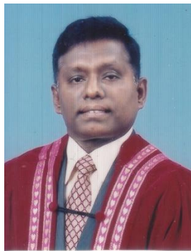
At the age of 43 years as Dean of the Faculty of Science