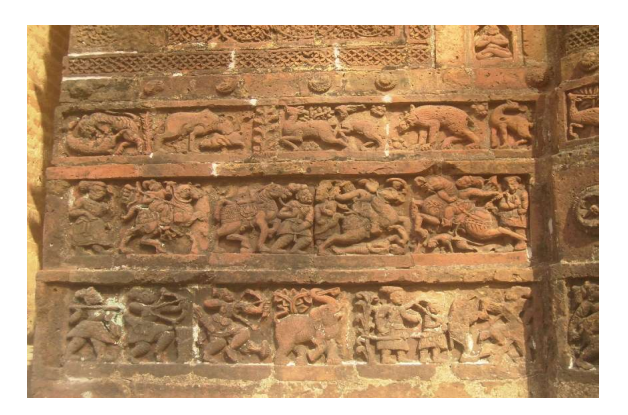
Pl 10 Wild elephant in forest breaking a tree, in center, Keshtorai temple, 1655A.D.,

P1 9 Elephants in domestic bliss, bearing the water pitcher for worship in both sides and trained elephants with their patrons in typical stance in center, Visnu temple, c.11<sup>th</sup> century, Kalacuri period, Janjgir Chhattisgarh