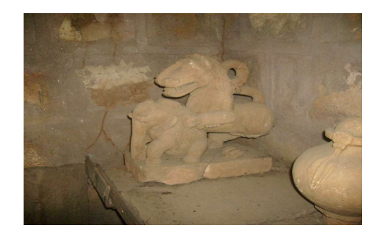
Pl 7, 8 gaja simha, Śiva temple, C. 11th century, Kalacuri period, Tuman Chhattisgarh