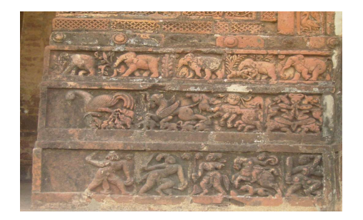
Pl. 5 Placing elephants in the basal mouldings of temple continued as a tradition Keshtorai temple 1655A.D. Malla dynasty Vishnupur West Bengal