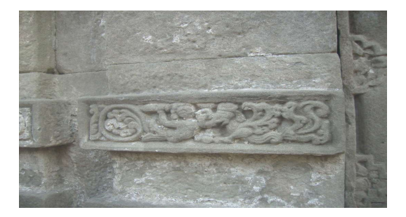
Pl. 6 Fanciful creature with face and trunk of elephant, fanciful creature, Śiva temple, c 11<sup>th</sup> century A.D., Krimchi Jammu