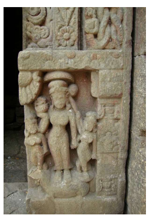
Pl 2 Goddess Yamuna left hand in gajahasta.Jageśvar Katyuri period c. 11<sup>th</sup> century

Tandeśvara temple Jageśvar Katyuri period c. 11<sup>th</sup> century