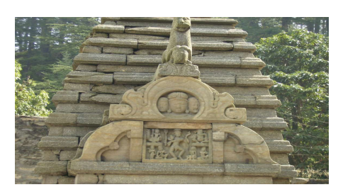
Pl 1 Namarāja application of gajahasta in lower left hand