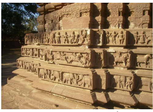
Pl 4 Gajathara in basal moulding, Śiva Temple, c.10<sup>th</sup>-11<sup>th</sup>centuryA.D., Fanināga period