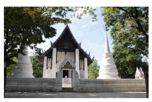
fig.1 WatDhammaram Ayutthaya

At present, Wat Thammaram has monks residing in its monastery. The temple area is divided into two main areas; the area where the religious ceremonies are performed and the area where the monks reside. The first area includes the main Bell-shaped Chedi, Sermon Hall or Vihara, and the Ordination Hall or Ubosot. The area is surrounded by walls. The latter area includes Hor Trai (a repository for the Buddhist scriptures), Bell Tower, Monastery, Sermon hall in a monastery, and Waterfront pavilion. (Phra Upali Maha Thero Museum, Wat Thammaram)