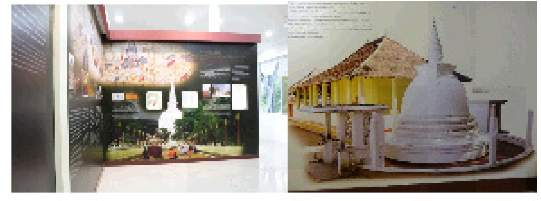
fig. 8 The Thailand – Sri Lanka religious relations in the service of Buddhism has had a long – standing record, going back more than 7 centuries

In 1755 a second monastic mission led by Phra Visuddhacariya Thera and Phra Varananamuni Thera, was sent to Lanka as a replacement for the first mission. King Borommakot also sent another 97 set of scriptures with the mission to make sure that Buddhist scholarship remained the pillar of Buddhism.