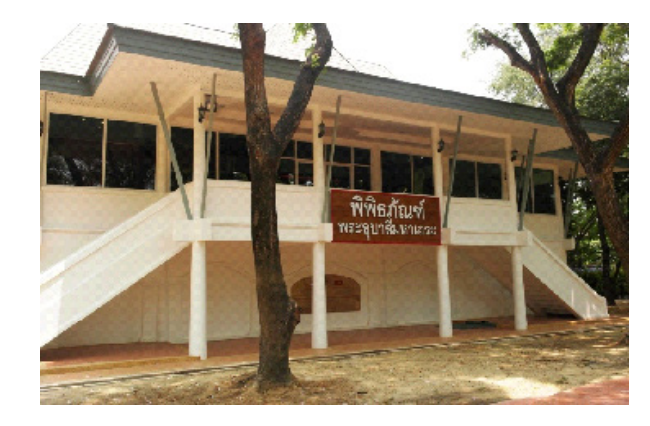
fig.2 The museum of Phra Upali Maha Thero at Dhammaram Temple in Ayutthaya

The vessel carrying the monastic mission led by Phra Upali Maha Thera was bombarded by enormous tidal waves, suffering leaks, with two masks torn down. It finally ran aground offshore in the bay of Nakhon Si Thammarat. The contingent had to return to Ayutthaya.