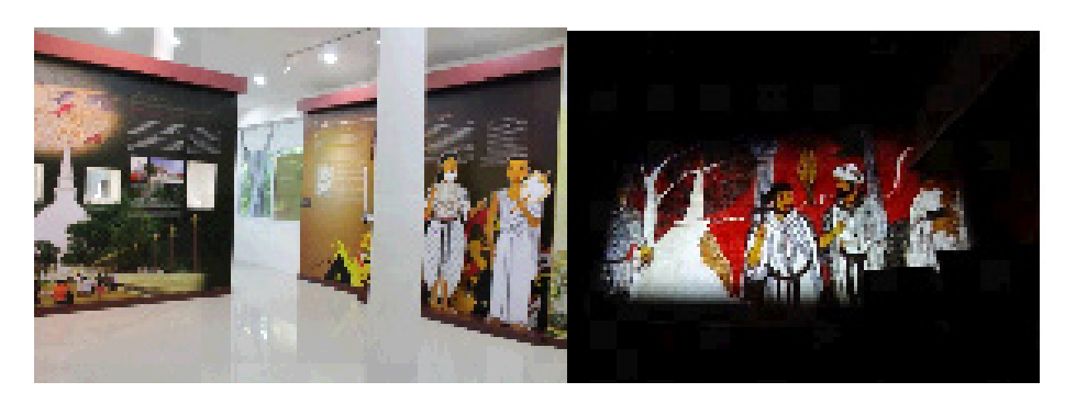
fig.5 Crisis in Buddhism Looming over Lanka

Thailand). Sometime later Siam reciprocated with the organizing of Siam Nikaya in Lanka. Over 700 years ago the wheel of law, Dhamma Chakra , known later as Lankavamsa ( Lanka Nikaya ) rolled into the land of Siam during the kingdom of Sukhothai, the Kingdom of Lanna and onto