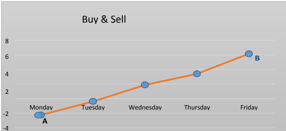
Graph 2: Buy & Sell Decision

According to the graph investor should buy the share at the point A and sell it at the point B. Through that the investor can maximize his return. (Capital gain). Because he can buy the share at lower price on Monday and he can sell it at highest price on Friday at highest market price.